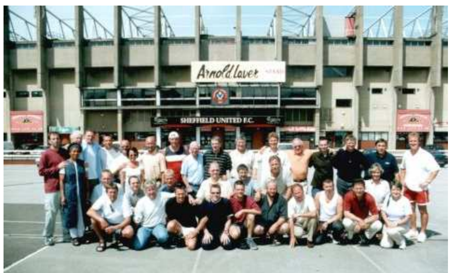
Visit Sheffield United