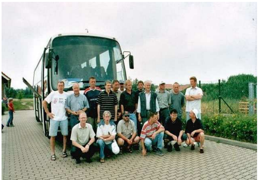
HSC Team 2003

The Alswede lads brought a 15ft oak tree as a present and as a long-living token of friendship. They brought forty litres, plus a barrel, of Barre Bräu. The lads too were very welcome.