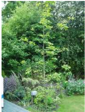
Regular bulletins are sent to Alswede informing them of the tree's state.

The caption of the presentation of the scarves reads "Despite our giving them presents they still won".