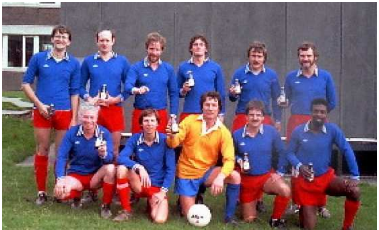
Team Sheffield 1981

The Sheffielders did a tour of the village.